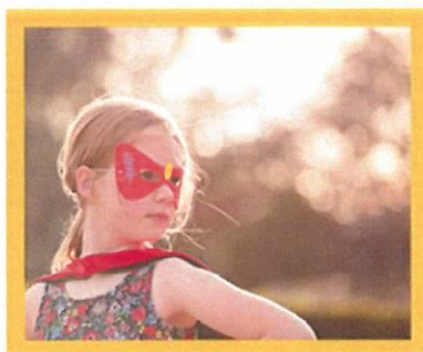
Masks & Magic

Your kids will experience fun workshops and activities to build their superhero characters from concept to reality. They'll create their costumes in Masks & Magic , bowl away the baddies in Strike Force! and complete their first superhero mission in Operation: Rescue .