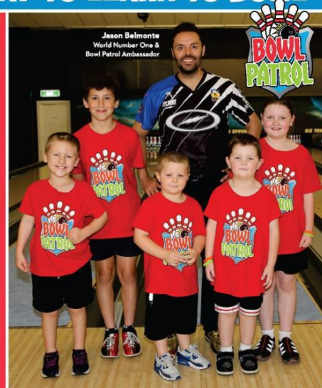
Jason Belmonte World Number One & Bowl Patrol Ambassador

For more information or to register go to www.bowlpatrol.com.au